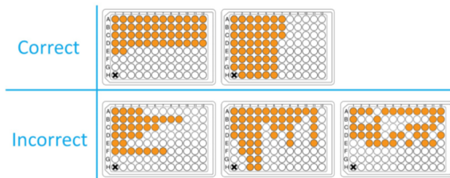
Figure 2: Preferred plate sample layout

The following plate types are preferred.